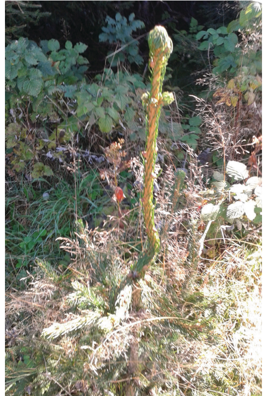
Figures 2-3. Damaged seedlings / Slike 2-3. Oštećene sadnice