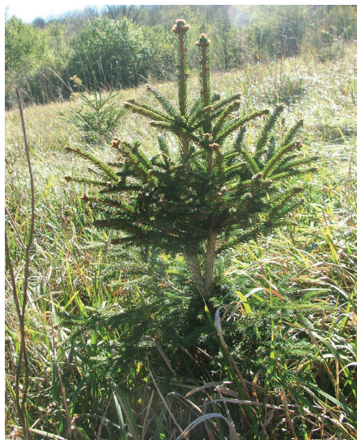
Figure 1. Damaged seedlings / Slika 1. Oštećene sadnice

Data were statistically analyzed by using the appropriate software packages: Microsoft Excel (ver. 2010) and Statistica (StatSoft Inc, ver. 7.0). The basic statistical parameters were calculated: arithmetic mean and standard deviation at the level of: blocks, population and half-sib lines. The differences among the survival rates at the level of blocks, populations and half-sib lines were tested by ANOVA ( p < 0.05 ), and post-hoc Duncan's multiple range test.